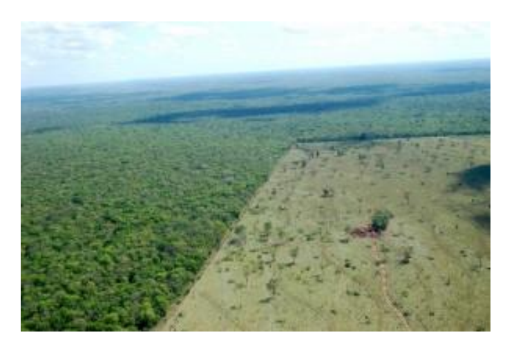
Figure 1. Clearcutting in Brazilian Pantanal